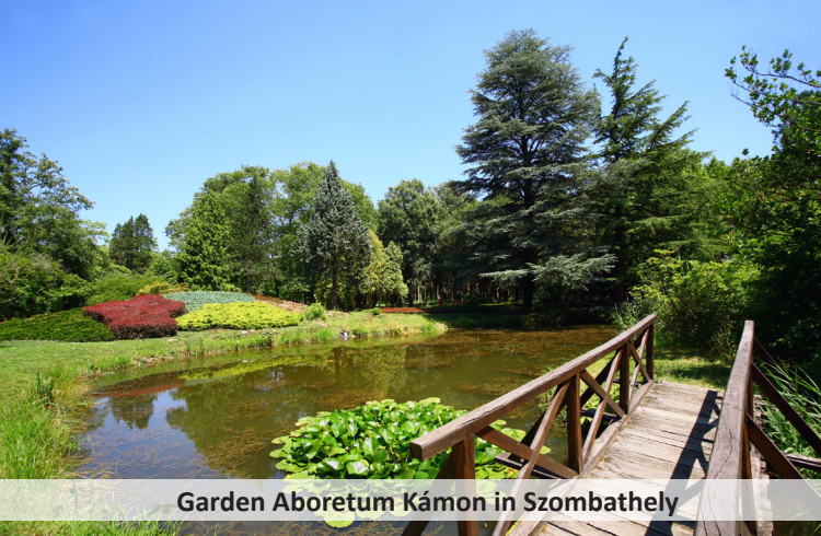
Garden Arboretum Kámon in Szombathely