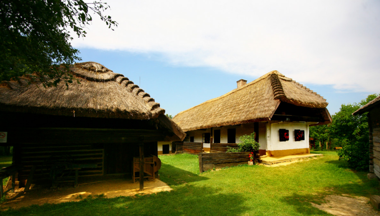
Educational trail “Life in the meadow orchard” in Szalafő-Pityerszer