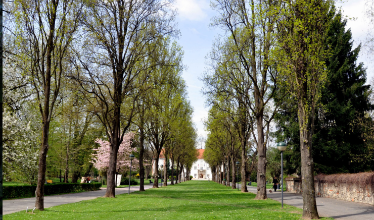
Town park in Murska Sobota