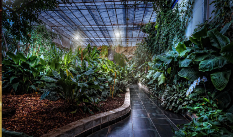
Tropical garden Ocean Orchids in Dobrovnik