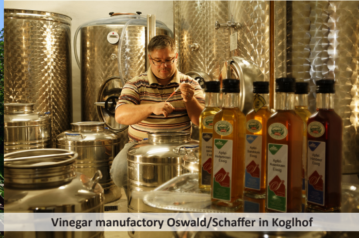
Vinegar manufactory Oswald/Schaffer in Koglhof