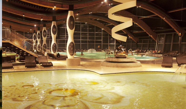
LifeClass Terme Sveti Martin